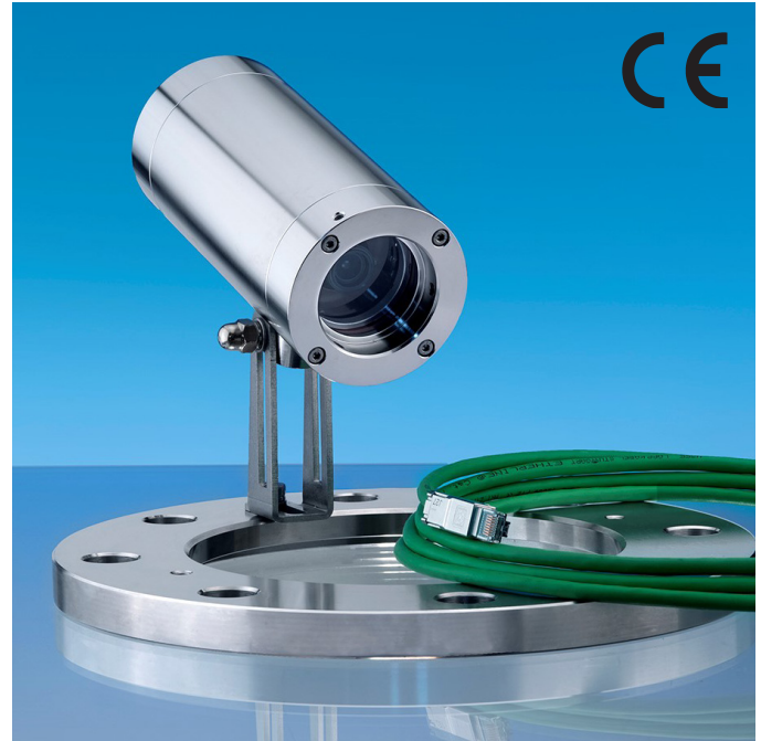
VISULEX camera K55-4K-Ex mounted on a flange with a hinged bracket

via the network cable (POE) IEEE 802.3af