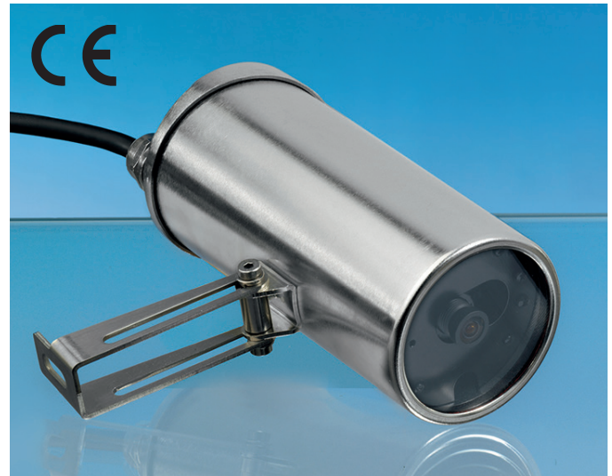
VISULEX camera K15-P-D with fixed lens

not only on the process and the reactor size, but also on the surface of the vessel, the medium in question, and the angle of incidence.