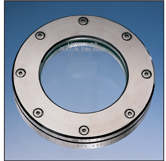
Complete assembly of circular stainless steel sightglass unit.

After welding in the base flange (1) into the vessel wall, gaskets (2), glass sightglass disc (3) and cover flange are carefully laid and bolted together with bolts (5). Tighten progressively on a diametric cross basis with hex wrench.