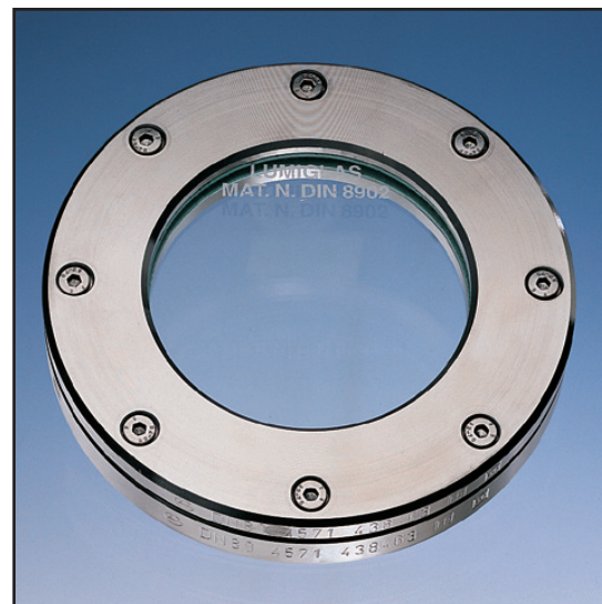
Complete assembly of circular stainless steel sightglass unit.

After welding in the base flange (1) into the vessel wall, gaskets (2), glass sightglass disc (3) and cover flange are carefully laid and bolted together with bolts (5). Tighten progressively on a diametric cross basis with hex wrench.