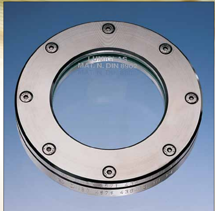
Complete assembly of circular stainless steel sightglass unit.

After welding in the base flange (1) into the vessel wall, gaskets (2), glass sightglass disc (3) and cover flange are carefully laid and bolted together with bolts (5). Tighten progressively on a diametric cross basis with hex wrench.