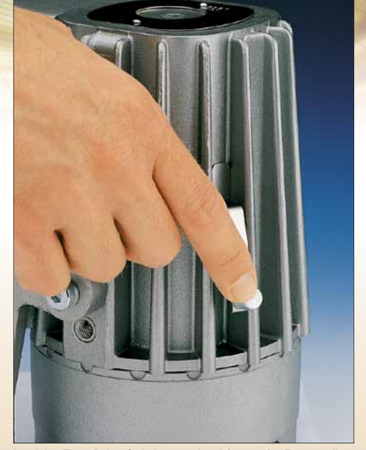
Lumiglas Time Delay Switch as optional feature for Ex as well as Non-Ex Lumiglas luminaires.