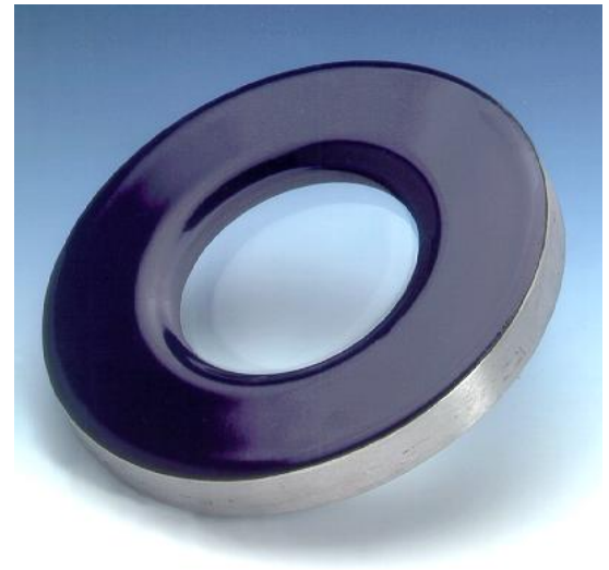
Enamelled Metaglas Sightglass