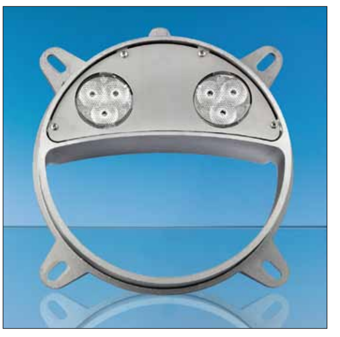
Lumiglas Luminaire Lumistar 225-LED