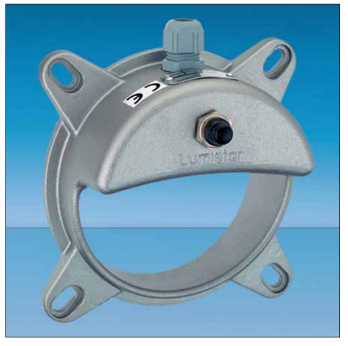
Lumiglas Luminaire Lumistar 225-LED