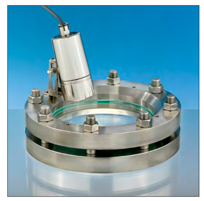
Application as combined sight and light port on a sight glass fitting acc. to DIN 28120, mounting by way of hinged bracket