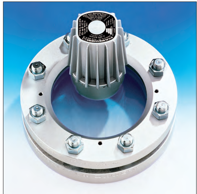
Application as combined sight and light glass on a sight glass fitting acc. to DIN 28120, mounted on a hinged bracket