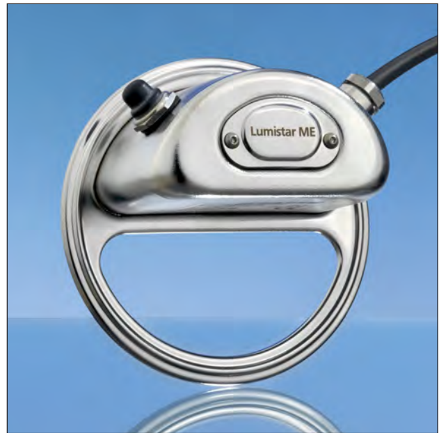
Lumistar Luminaire Crescent Design ME