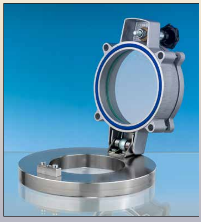
Lumiglas sight glass fitting SKS