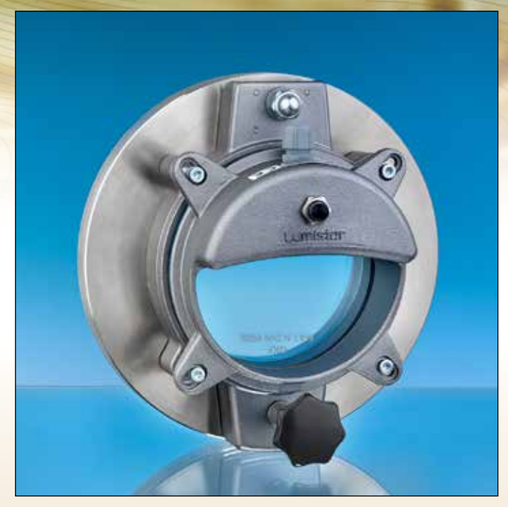
Lumiglas light sight glass fitting ESKS

Since the fitting must be opened for lamp change, reduce pressure in the vessel to zero, and put vessel out of operation. Check vessel for pressure and temperature before opening a sight glass fitting!