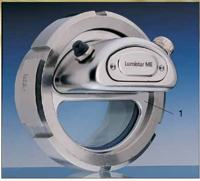
Complete unit of a Lumiglas light/screwed sight glass unit with luminaires type Lumistar ME