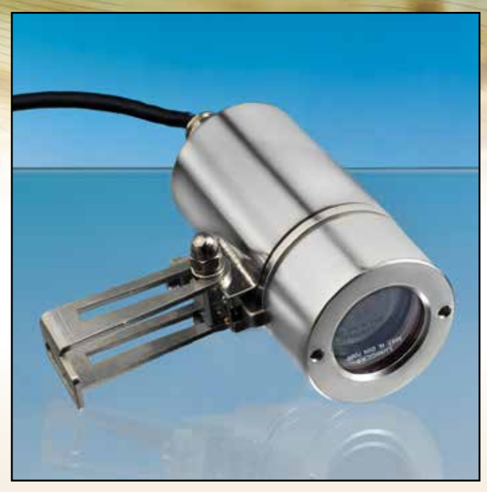
Lumiglas VISULEX K 25-Ex camera with zoom lens