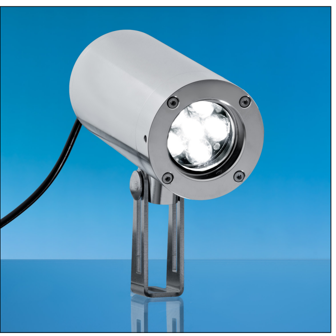
Lumistar luminaire ESL 55-LED-Ex