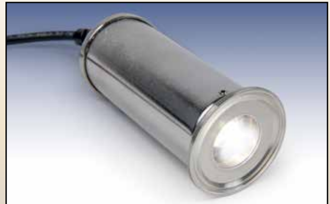
MetaPlex Light Port with Lumistar1000™ Light

media comes into contact with a single material. This is vital in sanitary service, as it eliminates crevices where contaminants can collect and micro-organisms can grow.