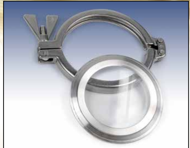
MetaPlex View Port for Sanitary Clamp Connection

MetaPlex windows are designed with a proprietary interlocking seal against the clear polymer, so the process