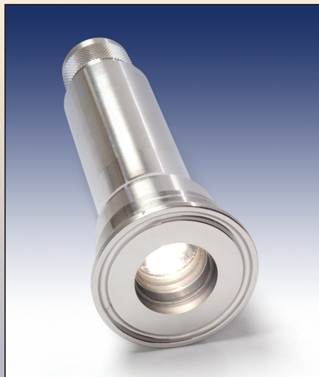
Cordless Light with MetaClamp Sanitary Connection