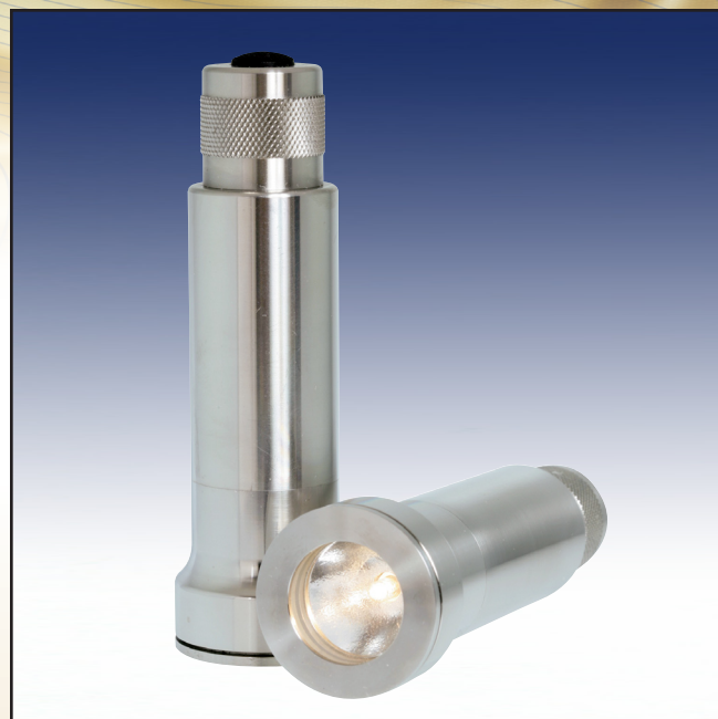
Cordless LED Light Series FLBP-LED for Portable Vessels