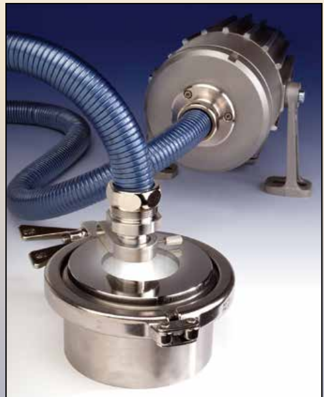
Lumiglas Fiber Optic Luminaire 'Lumiflex' on a 4" MetaClamp® Fused Safety Sight Window