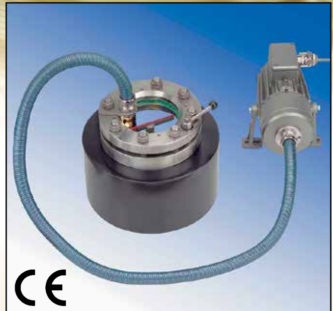
Lumiglas Ex Fiber Optic Luminaire 'Lumiflex' shown mounted on a DIN 28120 sightglass fitting combined with high pressure Lumiglas wiper unit (Type II)