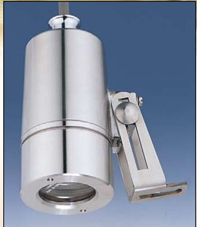
Stainless Steel Lumiglas Luminaire Type ESL 25-Ex with hinged bracket fastening, plain design, polished.

Straightforward electrical connection via integrated cable tail or Ex d cable entry gland.