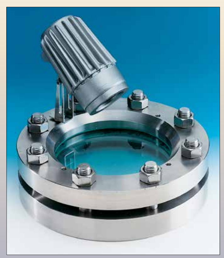
Lumiglas luminaire USL 05, pivoted back off the sightglass

ISO 9001 QA CERTIFICATE GERMAN MANUFACTURER: F.H. PAPENMEIER AWARDED QA APPROVAL CERTIFICATE