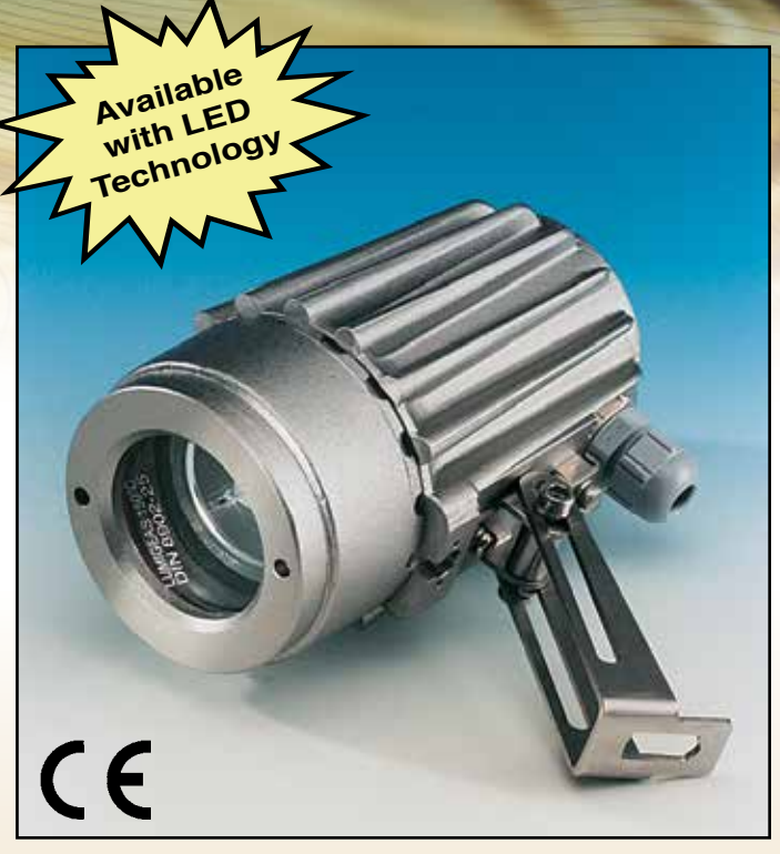
Lumiglas luminaire USL 05 with hinged bracket