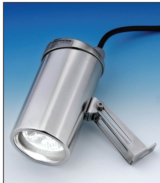
LumiStar2000 Luminaire Series USL15 with Mounting Bracket