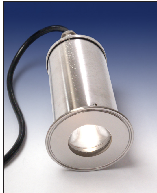
LumiStar2000 Luminaire Series USL35 with MetaClamp® Sanitary Clamp Connection