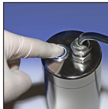
LumiStar2000 USL 15/35 with programmable on/off switch.

Example: LumiStar2000 Luminaire Stainless Steel USL35, 24V/30W