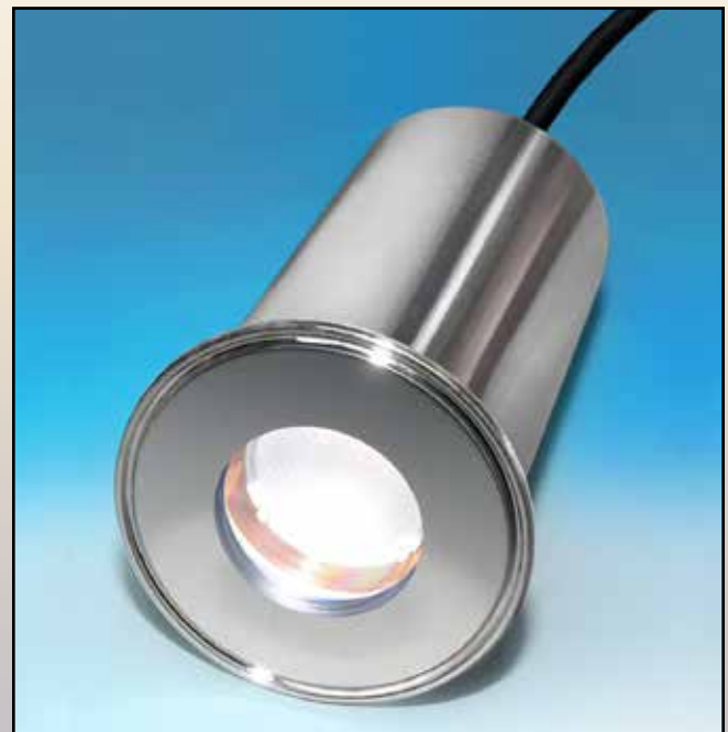
LumiStar3000 luminaire USL36 with MetaClamp® Sanitary Clamp Connection