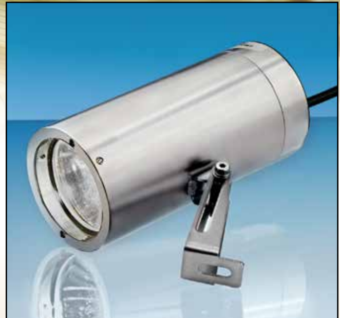
LumiStar3000 luminaire USL16 with Mounting Bracket