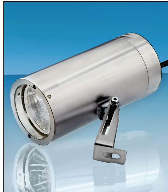
LumiStar3000 luminaire USL16 with Mounting Bracket