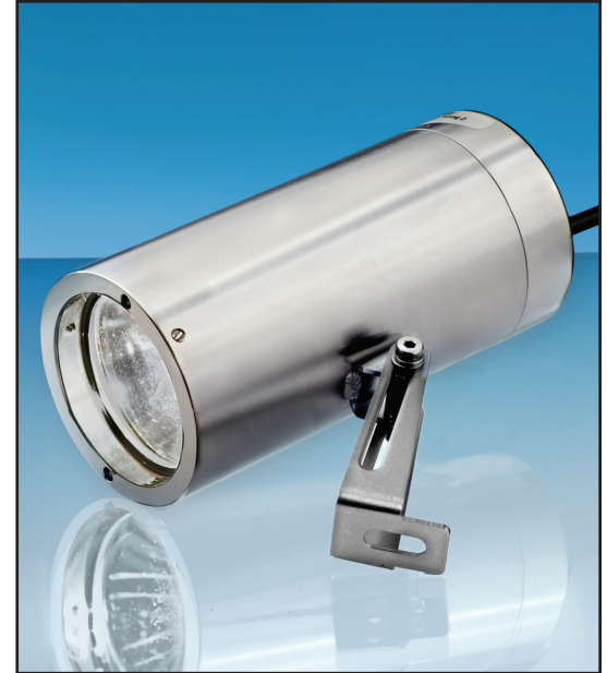
LumiStar3000 luminaire USL16 with Mounting Bracket