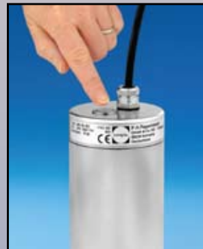
USL 16/36-LED with momentary on/off switch

Lumiglas Luminaire Stainless Steel USL 36-LED, 120V/9W, PN: 36LE-A3KNNN0N