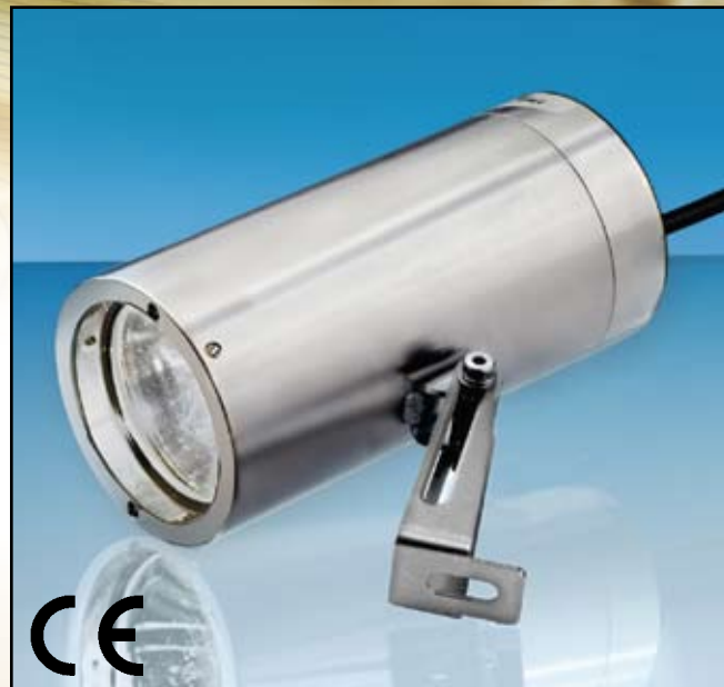
Lumiglas luminaire USL 16-LED with Mounting Bracket