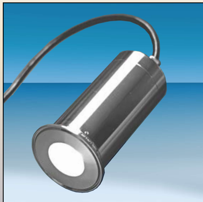
Lumiglas luminaire USL 36-LED with MetaClamp Sanitary Clamp Connection