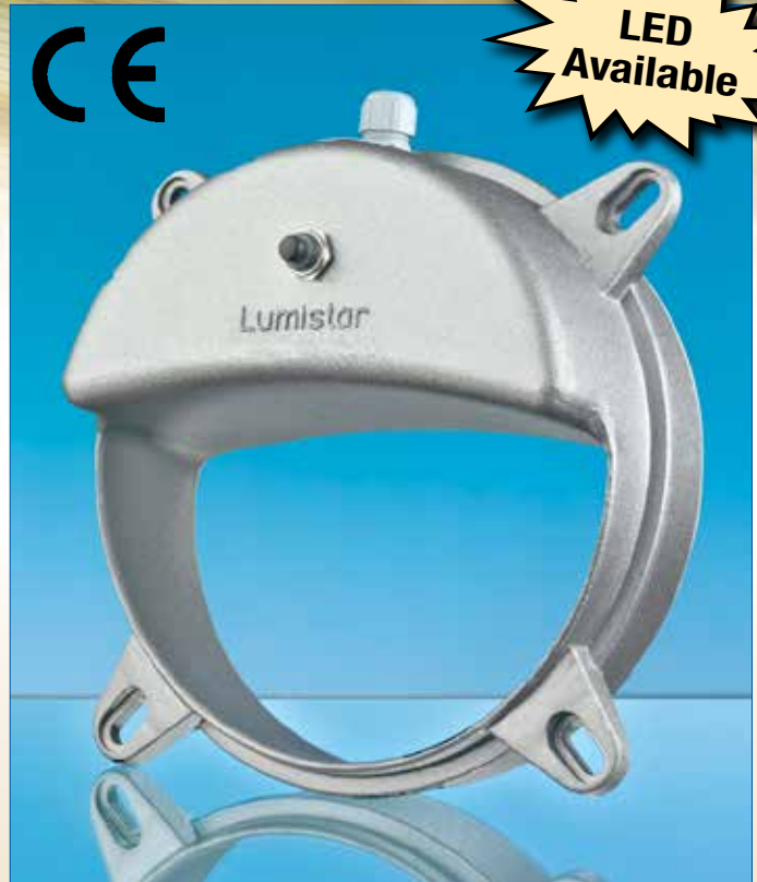
Lumistar luminaire, for installation on sightglass fittings