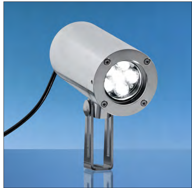
Lumistar Ex-Luminaire ESL 55-LED-Ex