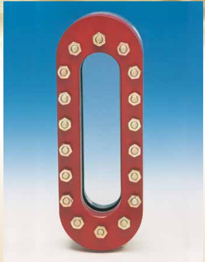
Obround Weld Pad Gages