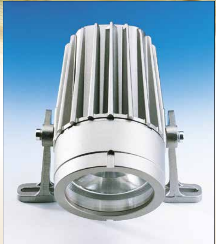
Lumiglas USL 07 with fastenings