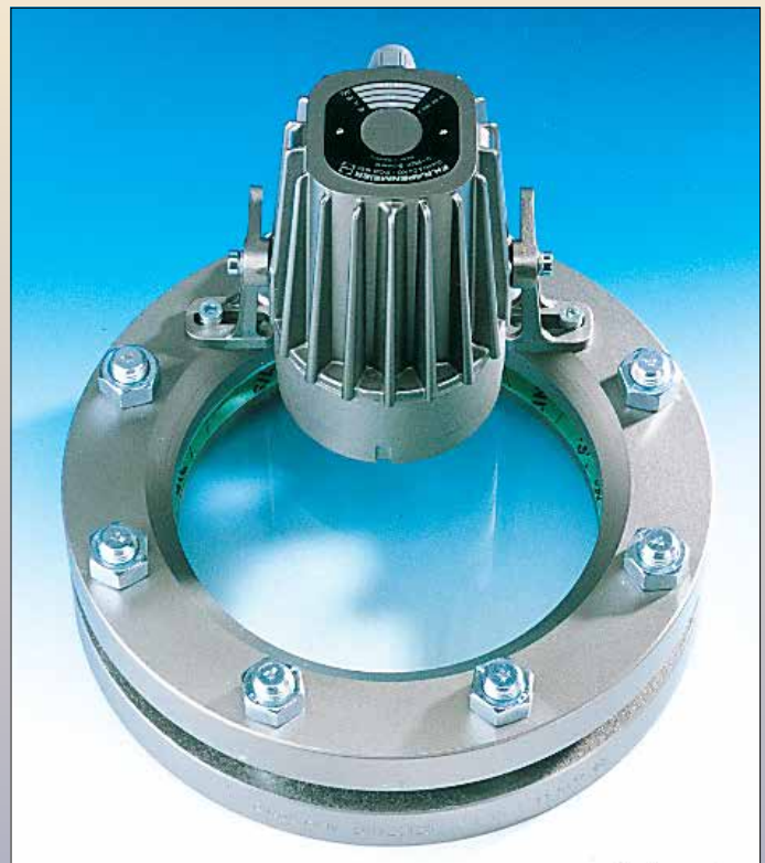
Lumiglas USL 07 installed on a circular sightglass DIN 28120