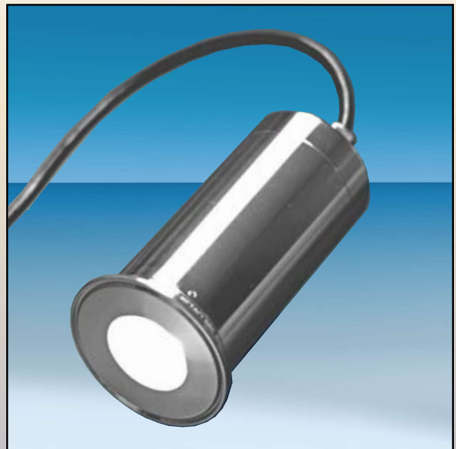
Lumiglas luminaire USL 36-LED with MetaClamp Sanitary Clamp Connection