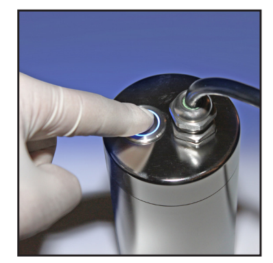
LumiStar3000 USL 16/36 with programmable on/off switch. State-of-the-art capacitive touch switch, operable with gloves.

Example: LumiStar3000 Luminaire Stainless Steel USL36, 24V/40W