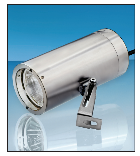
LumiStar3000 luminaire USL16 with Mounting Bracket

Low Voltage: 24V (AC or DC)High Voltage: 110-240V AC